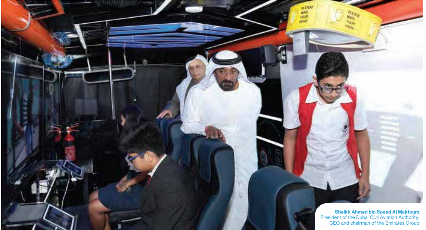
Sheikh Ahmed bin Saeed Al Maktoum President of the Dubai Civil Aviation Authority, CEO and chairman of the Emirates Group